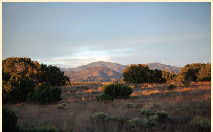
A herd of antelope frequent this property and the views abound of the Jemez, Sangre De Cristo, Ortiz and Sandia mountain ranges, and the Galisteo Basin.